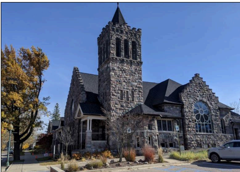
Standing strong and still looking great. The building as it looks today.